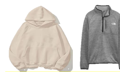
Must have zipper, snaps or buttons from top to bottom