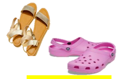
No open-toed shoes or Crocs