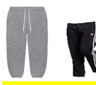
No sweatpants or athletic pants